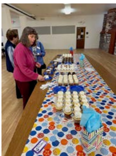
Board sets up table

Keweenaw Heritage Center was ready for a party and wanted to thank everyone who had helped to insure its survival. No dump trucks, no bushes in the sandstone, and the windows were intact. Exterior doors gleamed, organ music drifted outside, stairs were sound. The lower level looked like a great place to celebrate the progress that had taken place in the last 30 years.