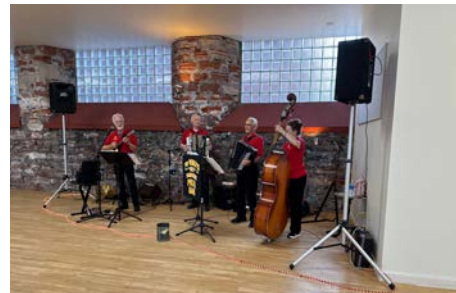
The World's Most Dangerous Polka Band