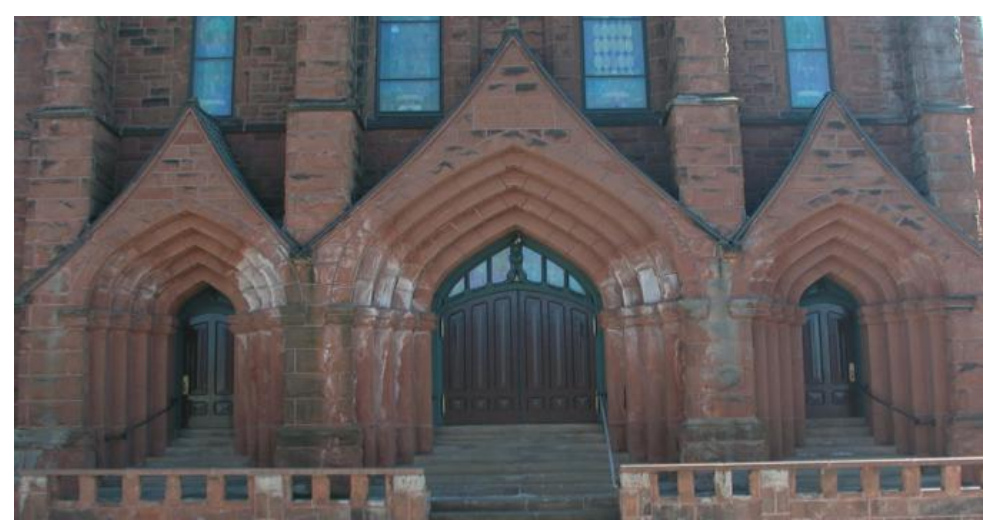
www.keweenawheritagecenter.org Find us on Facebook as Keweenaw Heritage Center